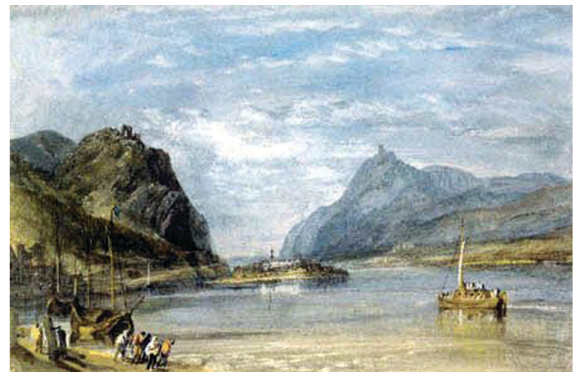
William Turner: "Rolandseck"