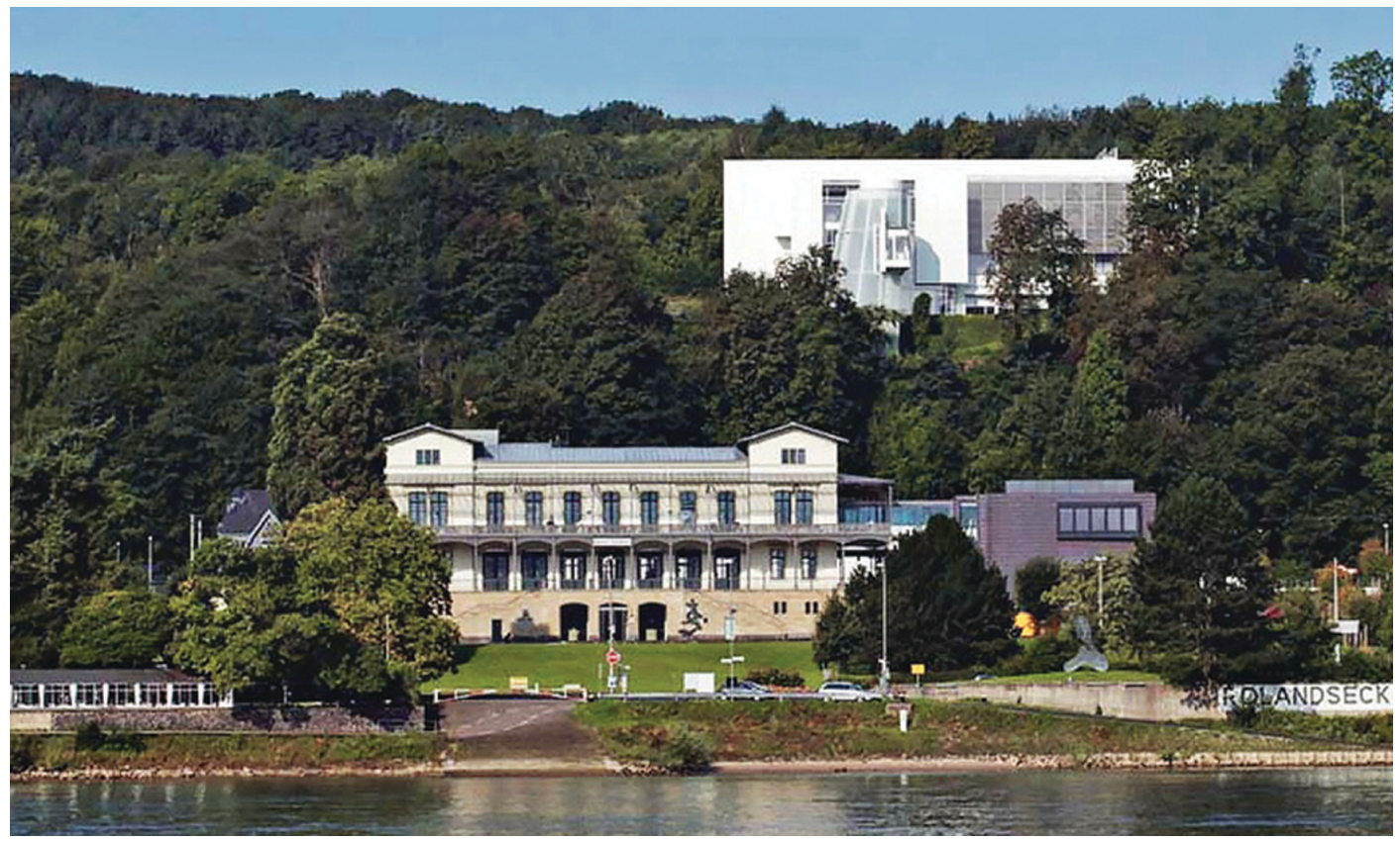
Rolandesck Station, Restaurant, Main Entrance to the Museum